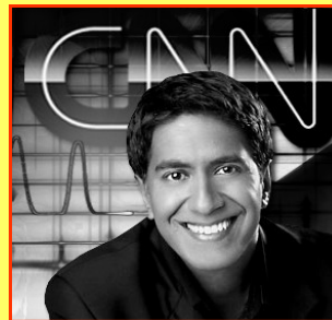
Dr. Sanjay Gupta Reported This Story On CNN